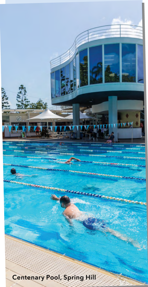
Centenary Pool, Spring Hill

Join the centenary celebrations on Sunday 23 March. Visit our website and search 'Sherwood Arboretum' for more information.