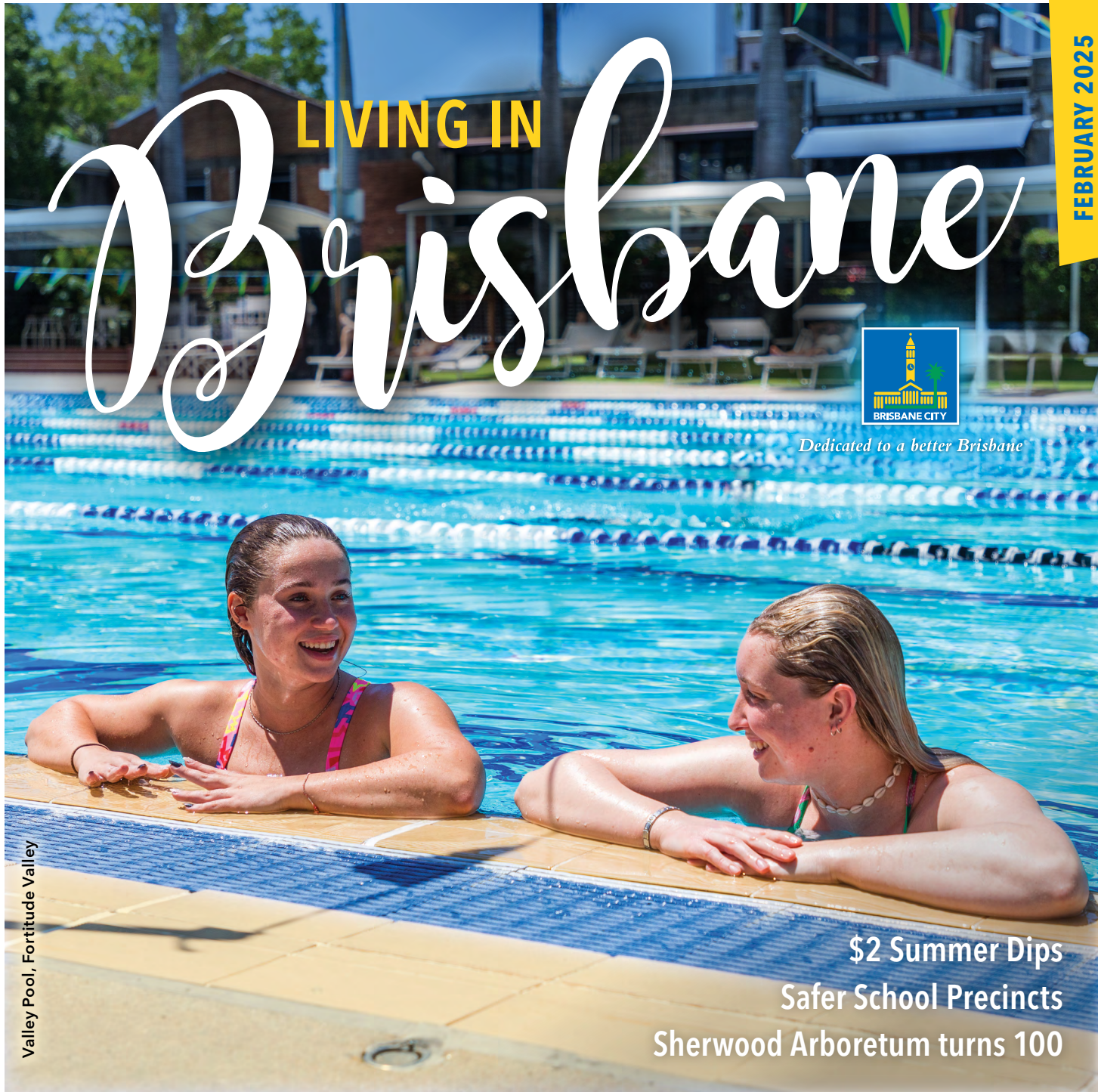
Valley Pool, Fortitude Valley

$2 Summer Dips Safer School Precincts Sherwood Arboretum turns 100