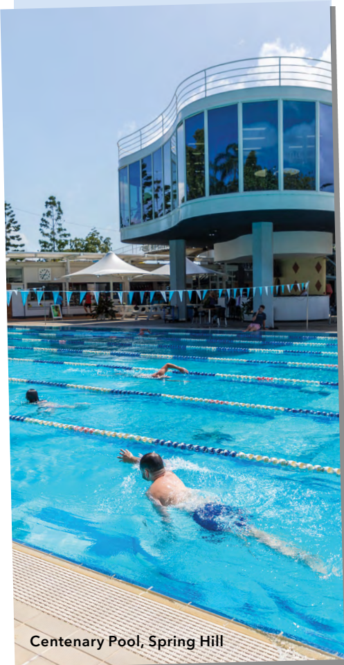
Centenary Pool, Spring Hill

Join the centenary celebrations on Sunday 23 March. Visit our website and search 'Sherwood Arboretum' for more information.