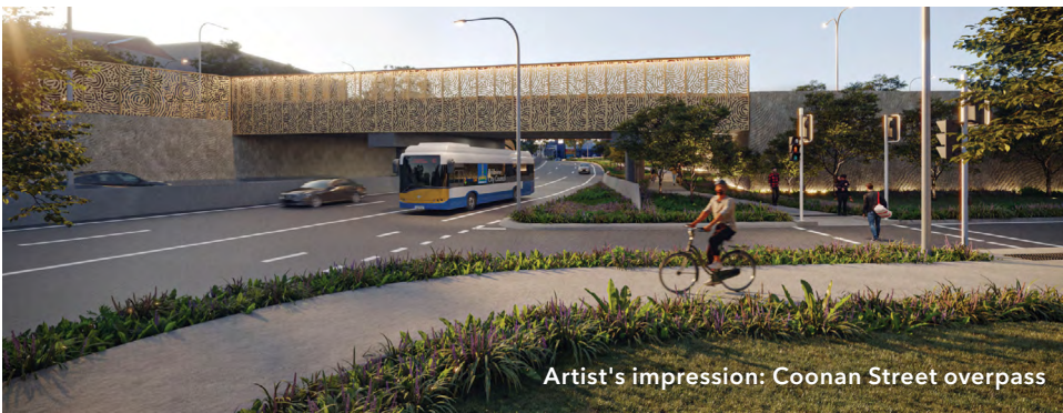
Artist's impression: Coonan Street overpass

Stay tuned for news about opening dates for the bridge's 2 unique dining venues - Stilts Dining, an above-water restaurant and bar, and Mulga Bill's, a riverside cafe at the city landing.