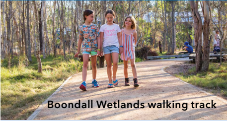
Boondall Wetlands walking track