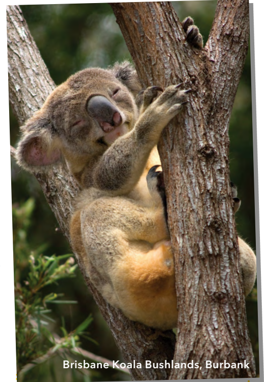
Brisbane Koala Bushlands, Burbank