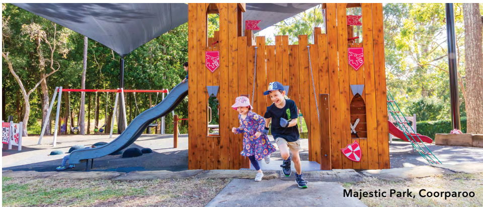
Majestic Park, Coorparoo

For more information, visit our website and search 'koala project'.