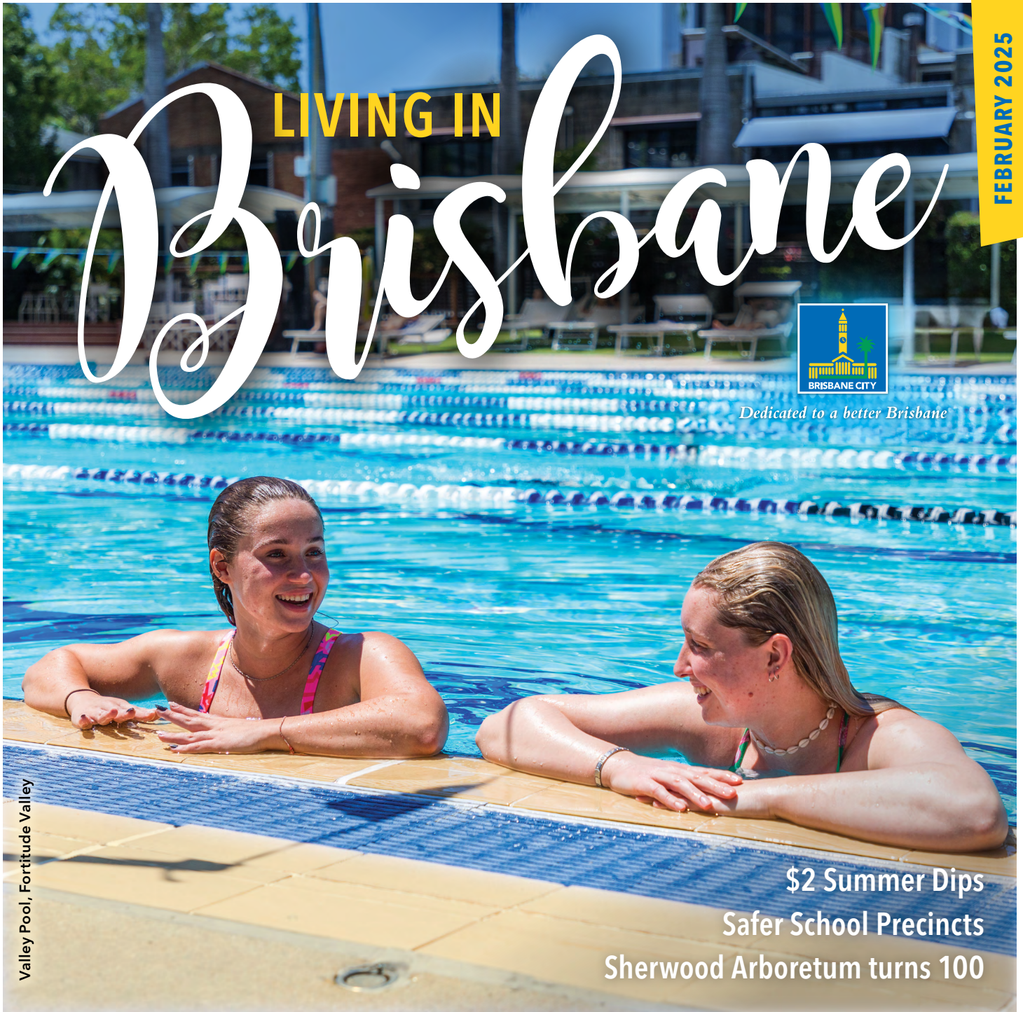
Valley Pool, Fortitude Valley

$2 Summer Dips Safer School Precincts Sherwood Arboretum turns 100