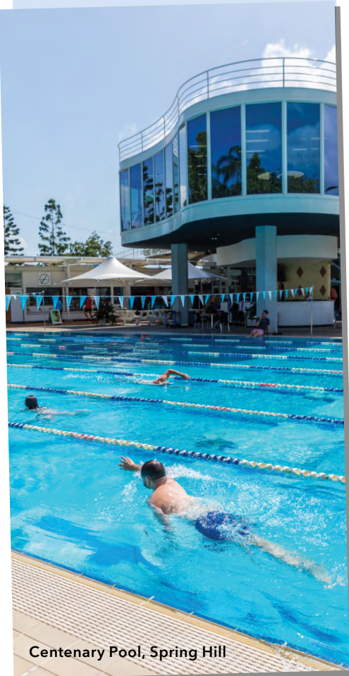
Centenary Pool, Spring Hill

Join the centenary celebrations on Sunday 23 March. Visit our website and search 'Sherwood Arboretum' for more information.