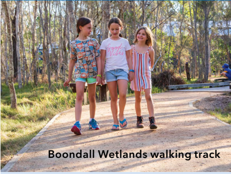
Boondall Wetlands walking track