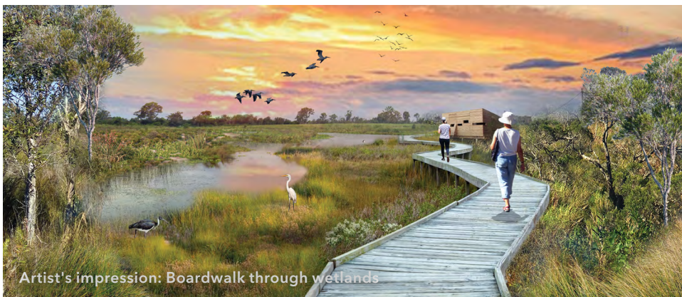
Artist's impression: Boardwalk through wetlands

More than 750,000 trips have already been taken over the Kangaroo Point Bridge since it opened last year, making it not just a must-do destination, but a critical transport connection that will help keep Brisbane moving for generations to come.