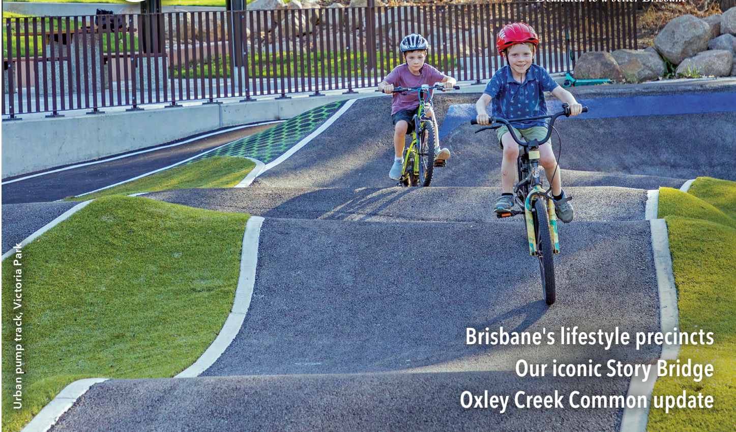
Urban pump track, Victoria Park

Brisbane's lifestyle precincts Our iconic Story Bridge Oxley Creek Common update