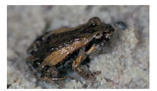
Wallum froglet, Crinia tinnula

This Conservation Action Statement addresses the wallum froglet ( Crinia tinnula )<sup>2</sup>, which is identified as a significant species within Brisbane as per Council's Natural Assets Planning Scheme Policy (Brisbane City Council 2000).