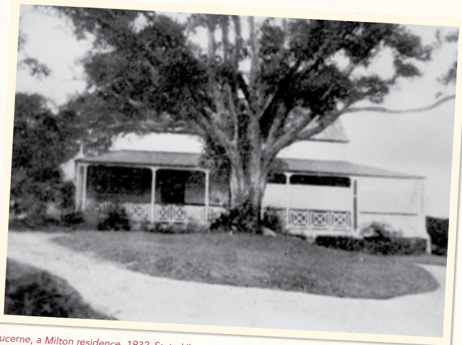
Lucerne, a Milton residence, 1932