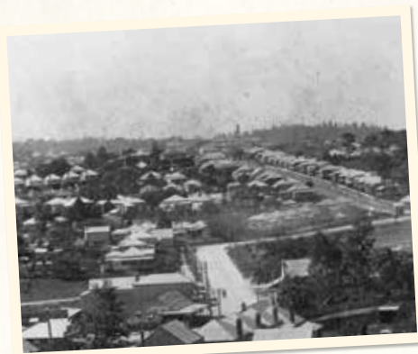
View Across Milton Heights from Rosalie, ca. 1914