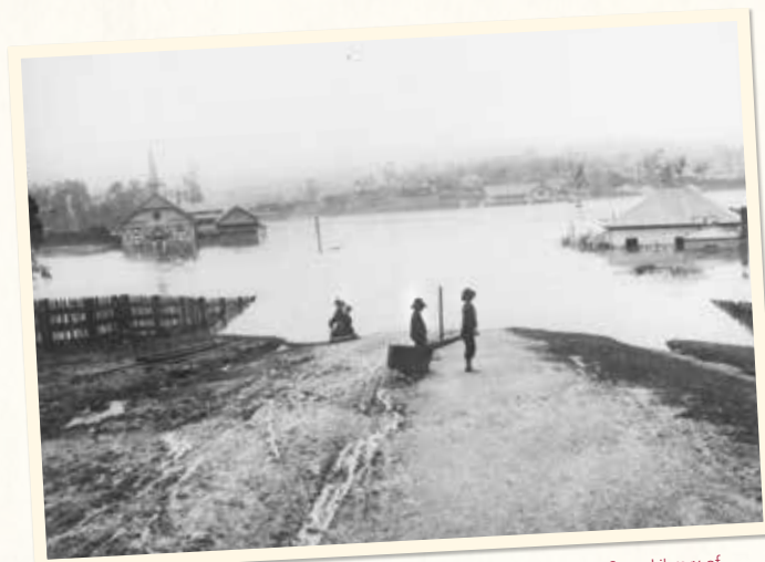
Milton Congregational Church and Milton Primary School under flood, 1890

From early on, Rosalie became home to a number of churches, established to meet the needs of a growing population. As well as the Congregational Church, the Rosalie Baptist Church was built on Ellena Street in 1884, the Roman Catholic Church of the Sacred Heart in 1898 on Given Terrace, an Anglican Church, St Martin's Church of England was built on the corner of Howard and Agars Streets in 1902 and the Rosalie Gospel Hall opened its doors on Bayswater Street in 1922.