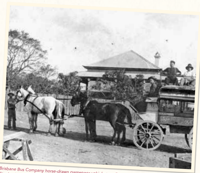
Brisbane Bus Company horse-drawn passenger vehicle travelling to Woolloongabba, Stanley Bridge and Coorparoo, 1904

Please note that 'Glentworth' is a private property and is not open to the public.