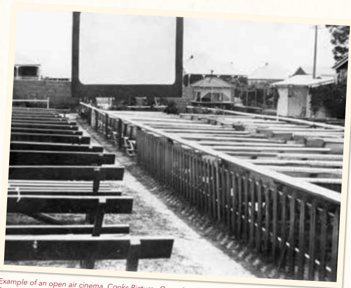
Example of an open air cinema, Cooks Pictures Open Air Cinema in Sherwood, ca 1925

From 1942, on Tuesday, Friday and Saturday nights, the 'Beverley Theatre' was run from the Rosalie School of Arts. In the era before television, the 300-seat picture theatre provided entertainment for Rosalie residents. By 1957, perhaps due to decreased patronage caused by the introduction of television to Australia in 1956, the Beverley Theatre had closed.