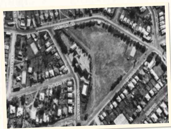
Aerial photograph of Gregory Park, 1946

"Residents in the vicinity were loud in their complaints, and the medical men said it was a regular breeding place for the germs of disease. A great deal of typhoid fever had existed in that neighbourhood lately and it was thought that it had taken its rise from this swamp" ( The Brisbane Courier , 24 July 1896).