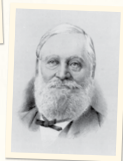
Honourable Sir Augustus Charles Gregory, State Library of Queensland, Negative Number 167303

surveyor-general, a position he held for almost 16 years. He also served as the colony’s commissioner of crown land. In 1882 he was appointed to Queensland’s Legislative Council and in 1902 he was elected the first mayor of Toowong Shire Council.