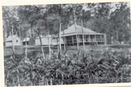
Rainworth, residence of Sir Augustus Charles Gregory, Bardon, ca 1885

In 1859, with Queensland’s separation from New South Wales, Gregory was instrumental in establishing the new colony’s southern border. In the same year he was appointed Queensland’s first