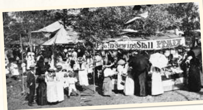
Rosalie and Milton Patriotic Fete during World War I, 1915

Please note that 'Boondah' is a private property and is not open to the public.