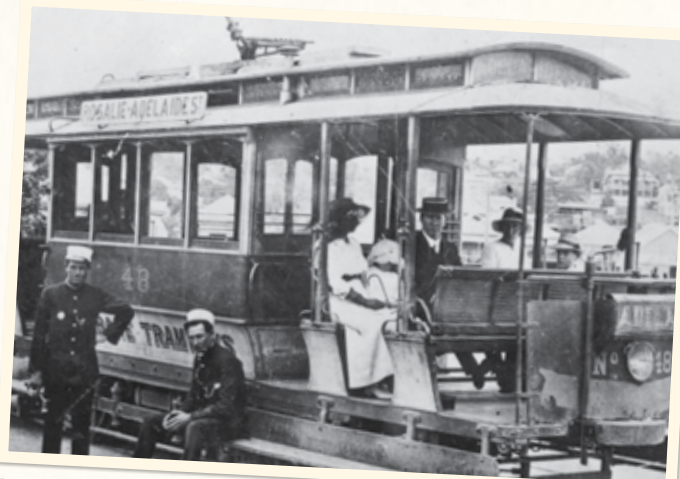
Rosalie-Adelaide Street Tram Number 48, ca 1900, Brisbane City Council, Image Number BCC-C54-3804K

When the tramline down Elizabeth Street was officially opened in October 1930, the ceremony was attended by Lord Mayor William Jolly. Three special cars, the first filled with dignitaries, slowly travelled down Elizabeth Street along the new extension amid cheers from happy residents. A brass band followed behind the first car and added to the festival atmosphere. The Brisbane Courier reported that: