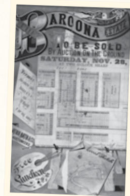
Map for Auction of the Baroona Estate 28 November 1885, State Library of Queensland, Negative Number 196464

Rosalie's first school opened in 1889 and is known today as Milton State School. By the turn of the century, several churches had been established including the Catholic Church of the Sacred Heart, Rosalie Baptist Church, St Martin's Anglican Church and a Congregational Church.