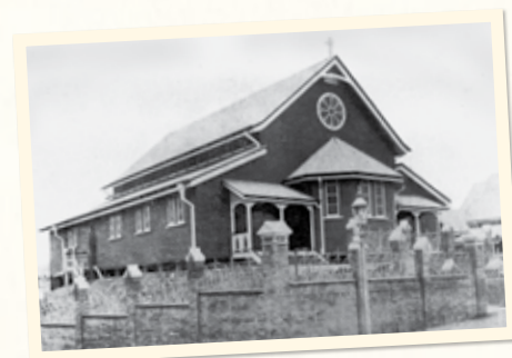
Second Sacred Heart Church, 1914, State Library of Queensland, Negative Number 7911

Under the leadership of Archbishop Duhig (1917-1965) an unprecedented amount of property acquisition and building was undertaken by the Catholic Church across Brisbane. 'Duhig the builder', a term of endearment used by his contemporaries was renowned for purchasing prime sites (often on the crest of hills) on behalf of the Catholic Church for the construction of new churches,