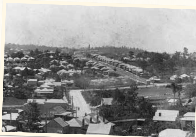
View across Milton Heights from Rosalie, ca. 1914, State Library of Queensland, Image No. 64045

In Rosalie, most of the large estates were subdivided under this Act. The subsequent sale of the land followed a pattern common in Brisbane in the mid-to-late 19th Century – the wealthier residents bought land on the rises and tops of hills which ensured breezes, views and protection from flooding and waste runoff. The less wealthy purchased more affordable land at the base of the hills.