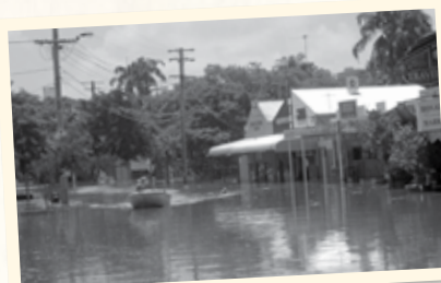
Dinghy travelling down Baroona Rd, Rosalie, 2011 Floods

On 4 February 1893 the first of the three flood events heavily impacted the residents of Rosalie, washing away many homes and possessions. Then on 13 and 19 February residents were forced to endure more devastation as further flooding swept through the area. 'Red Jacket Swamp' was one of the first places in Brisbane to fill with floodwaters that quickly flowed over Baroona Road and into Nash Street.