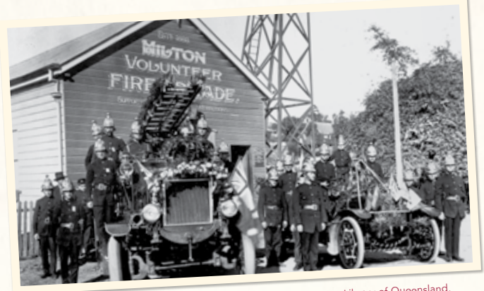
Milton Volunteer Fire Brigade in front of the Milton Fire Station

In 1918, the Milton Volunteer Fire Brigade was amalgamated into the Ithaca Fire Brigade and relocated to a new station building in Paddington. The tower was relocated there and the Milton station building eventually demolished.