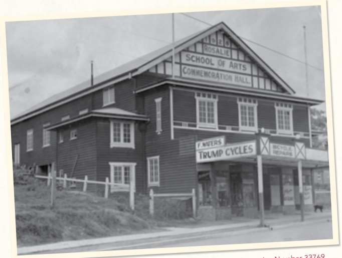
Rosalie School of Arts, Brisbane, 1938

As was common at the time, the hall was planned as a School of Arts where the community could utilise the reading library and meeting rooms. Traditionally, School of Arts buildings were established to provide adult education for the community and became very popular in the late 19th and early 20th Centuries in Australia.