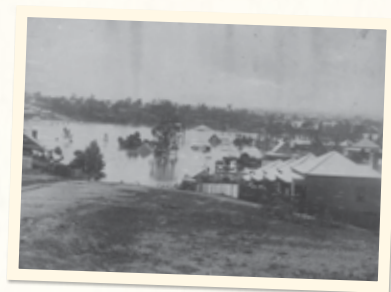
1893 floods taken from the Rosalie Torwood area looking towards old Bishopsbourne

"The water stretched in one sheet, unbroken save by an occasional tree or housetop, from the foot of the hills around Bayswater, Rosalie and Baroona, clear away to West End and St Lucia"