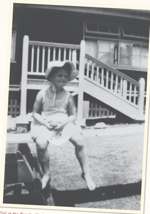
Girl at the Rosalie Kindergarten, ca. 1945, State Library of Queensland, Negative Number 74347

"Everything has been designed from the viewpoint of the child. The windows are wide, and low enough for rows of little heads to look out...All the furniture is built for little children...As rest is quite as important as play, the kindergarten has stretchers and cots for the sleepy hours" ( The Sunday Mail , 24 November 1935).