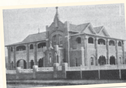
Our Lady of Christians Convent 1919, Catholic Archives