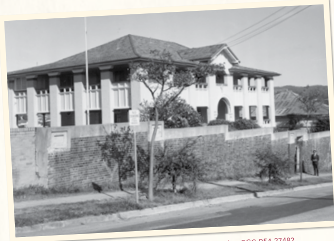
Fernberg Road – Rosalie 1967, Brisbane City Council, Image Number BCC-B54-27482

The Brothers were renowned for their focus on providing high-quality and affordable education and opened the first Marist Brothers' school in Queensland in January 1929 with 135 enrolments. At the opening ceremony, Archbishop Duhig stated: