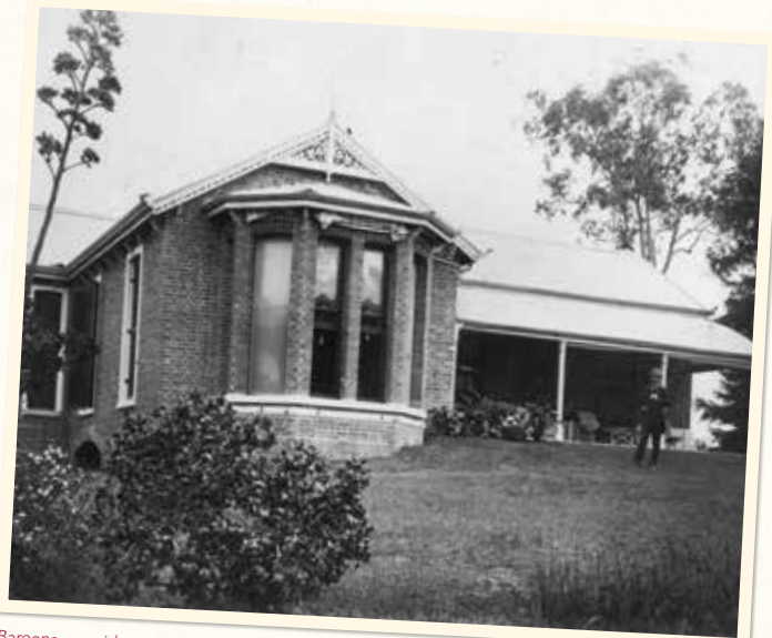
Baroona, a residence in Paddington, Brisbane, 1886, State Library of Queensland, Image No.62754

Please note that 'Baroona' is a private property and is not open to the public.