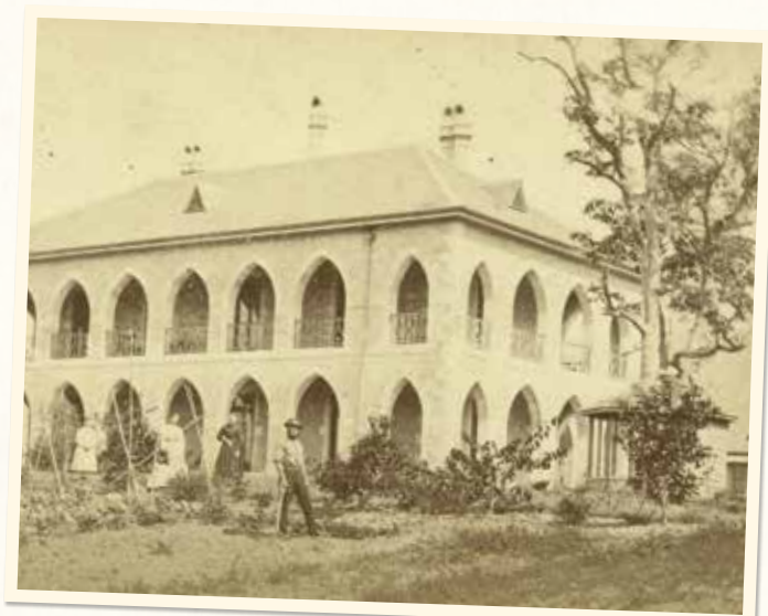
Bishopsbourne in Milton, ca 1870s