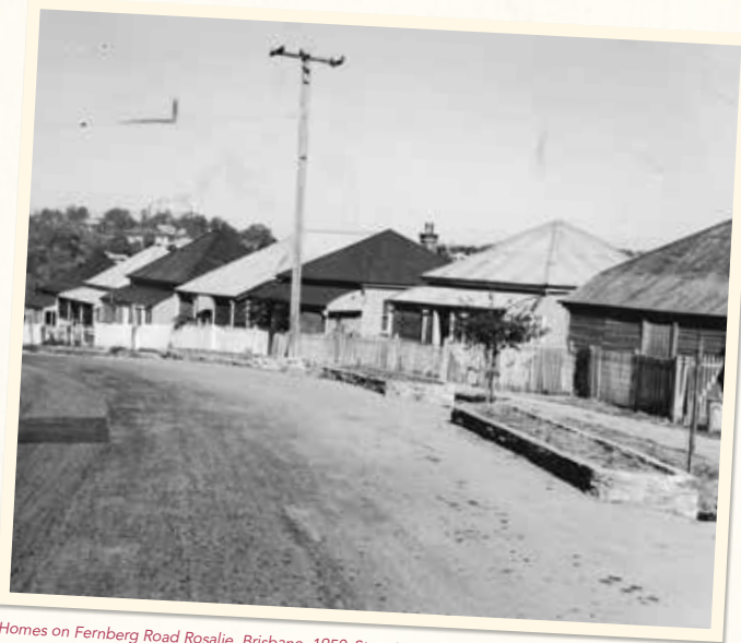
Homes on Fernberg Road Rosalie, Brisbane, 1950, State Library of Queensland, Image Number 191858

The royal visitors, Queen Elizabeth II and the Duke of Edinburgh, arrived at Eagle Farm Airport in Brisbane on 9 March 1954. They travelled along Kingsford Smith Drive, through Fortitude Valley, the city, down Coronation Drive, Park Road and up Fernberg Road to Government House. Along the way thousands of excited Brisbane residents welcomed the couple. Many of the buildings were elaborately decorated in celebration. The royal tour spent 10 days in Queensland and it was the first time a reigning English monarch had visited Australia.