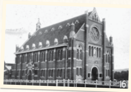
Church of the Sacred Heart, ca 1926, Catholic Archives

This striking brick church was blessed and opened in June 1918 and was the third Catholic Church building in the Rosalie parish. The Catholic population in the Rosalie area had risen steadily in the late 19th Century and each Sunday local Catholics had to travel to the city or Red Hill to attend mass. It became clear to Archbishop Dunne (1887-1917) that Rosalie needed its own church.