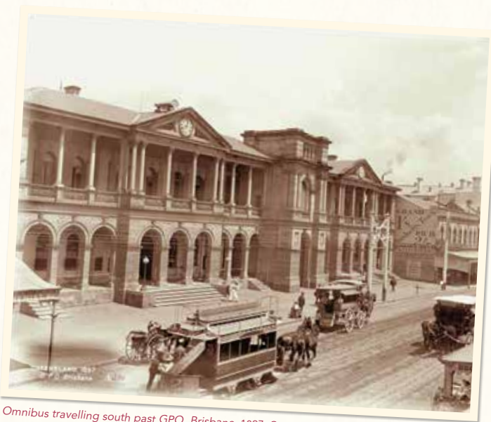
Omnibus travelling south past GPO, Brisbane, 1897

As Brisbane's train and tram networks were developed, they provided greater comfort and speed to Brisbane residents and the city's omnibus businesses were rendered unprofitable. In Rosalie the omnibuses ceased operations by 1912.