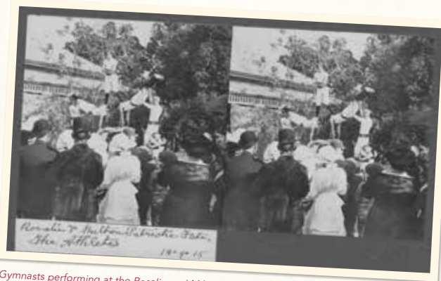
Gymnasts performing at the Rosalie and Milton Patriotic Fete, Brisbane, 1915