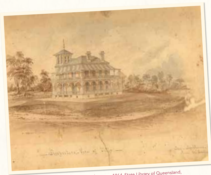
Perspective drawing of Villa Fernberg, Brisbane, ca 1864, State Library of Queensland, Image No.193620

In 1910 'Fernberg' was leased to the Queensland Government to be used as a temporary Government House following the establishment of a Queensland university in the original Government House in the city. The intention was to have a new Government House constructed in Victoria Park, but this was never completed. Instead, in 1911 the government purchased 'Fernberg' which then became Queensland's permanent vice-regal residence. 'Fernberg' remains the Queensland Governor's residence.