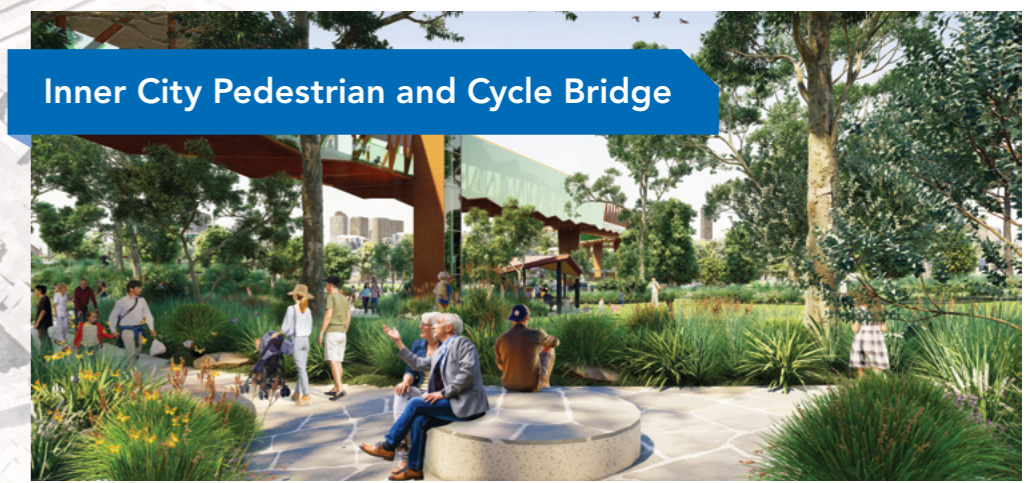
Inner City Pedestrian and Cycle Bridge