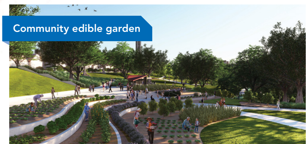
Community edible garden