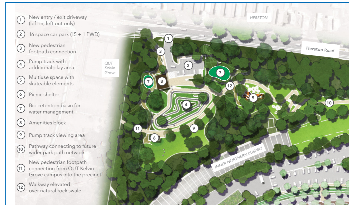
This plan is subject to further investigations and may change.

As an early project in the park, the urban pump track has progressed through a development assessment process in accordance with Brisbane City Plan 2014 . The concept plan below shows the design, which includes a picnic shelter and seating, an amenities block, connecting pathways, a small car park with 16 parking spaces, and a new entry and exit way.