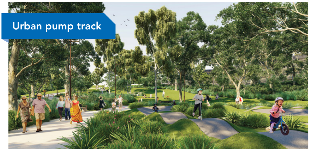
Urban pump track