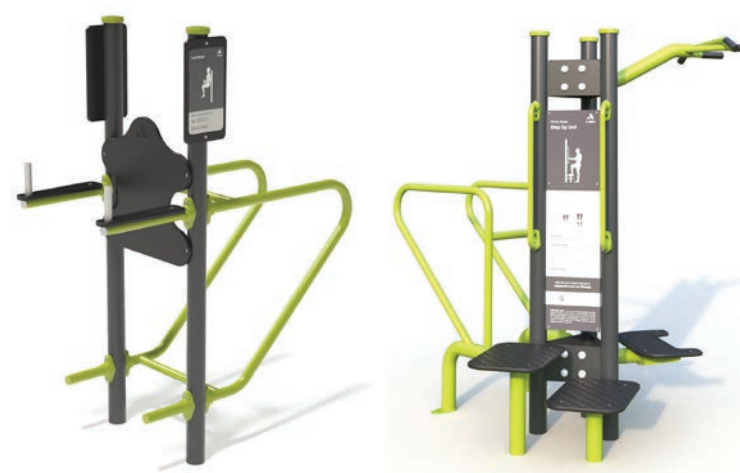
Static fitness stations: leg raise, body dips, step up station, body pull & push up