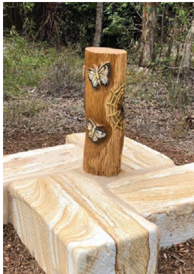
Casual seating pods. Carved timber posts with nature theme placed within sandstone blocks