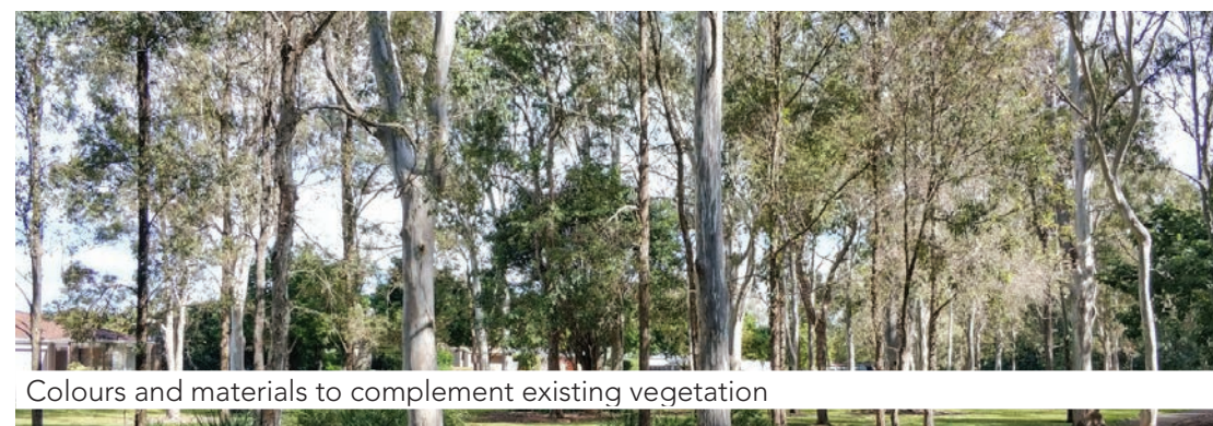
Colours and materials to complement existing vegetation