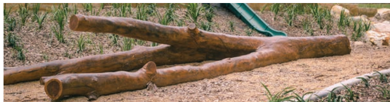
Use of natural materials to create play elements