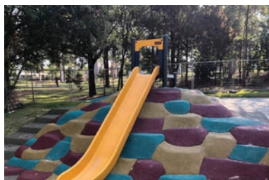
Play mound with slide and playful rubber figures