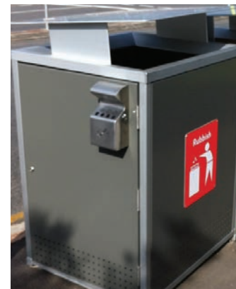
Standard 240L bin