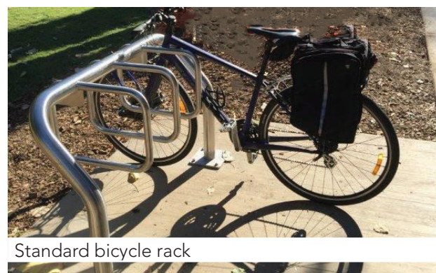
Standard bicycle rack