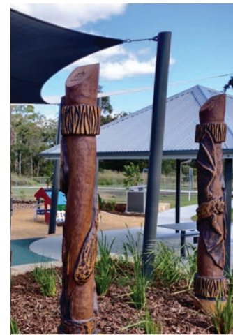
Carved timber posts