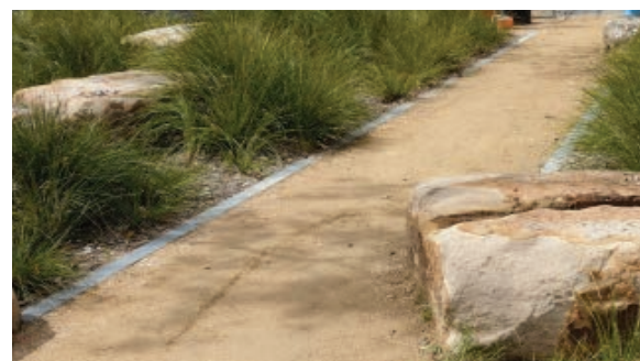
Natural track through garden beds