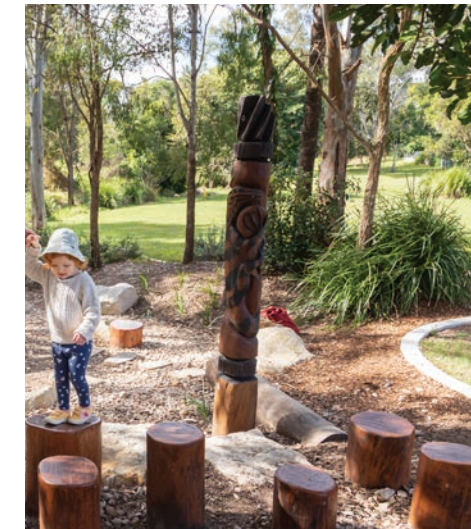
Timber steps at varying heights