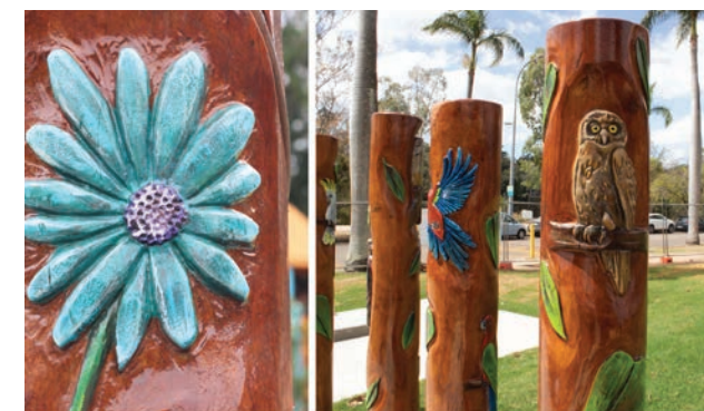
Balancing logs and carved timber posts